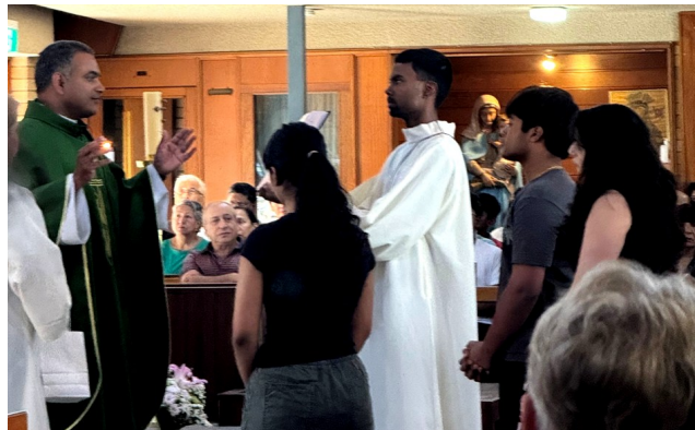
Image from HSC blessing last weekend

Parish Pastoral Council Meeting - will take place on Thursday, 23rd October at 7pm. If you have any items that you would like the council to discuss at the meeting, please send in your submissions to the parish office via email - secretary@stanthonyschurch.org.au on or before the 21st October to be included in the Agenda.