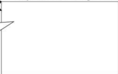
Draw Jesus making a miracle.