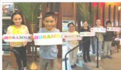
Above: The Sacramental students holding Hosanna Signs at our Palm Sunday mass. Below: Our youth and young adults at St Patrick's Cathedral for Palm Sunday mass after the street procession with CYP

Come along for a night of worship and fellowship!